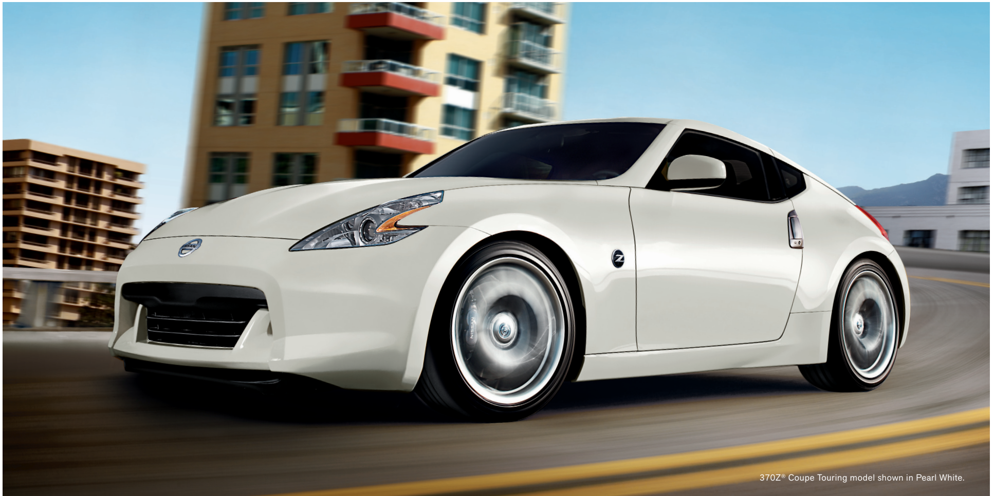
370Z® Coupe Touring model shown in Pearl White.