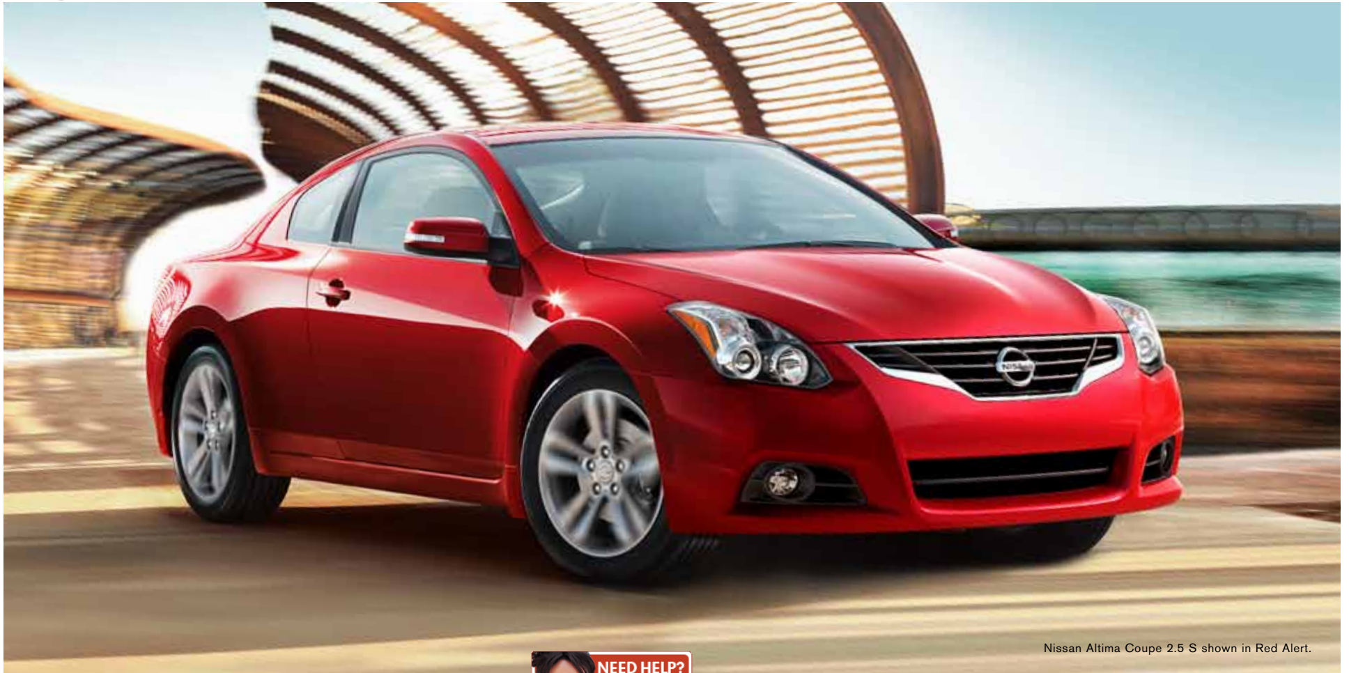
Nissan Altima Coupe 2.5 S shown in Red Alert.