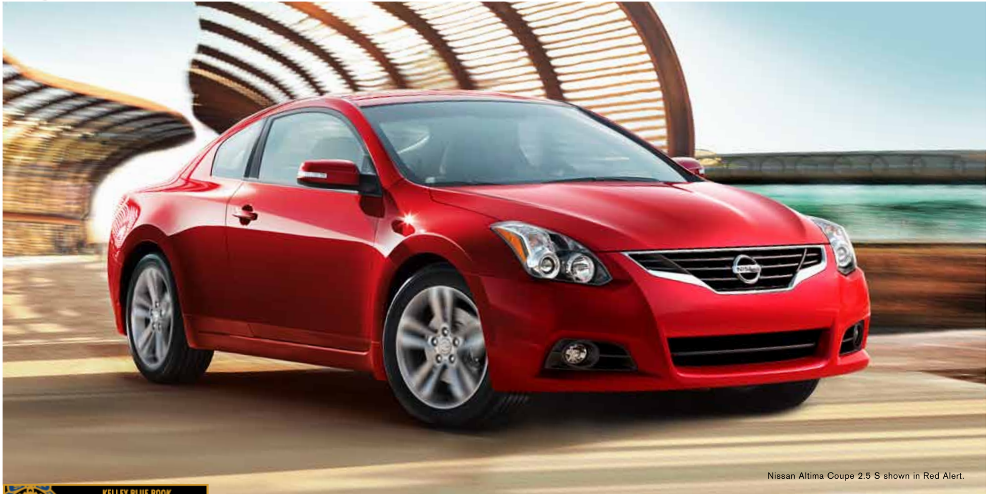
Nissan Altima Coupe 2.5 S shown in Red Alert.