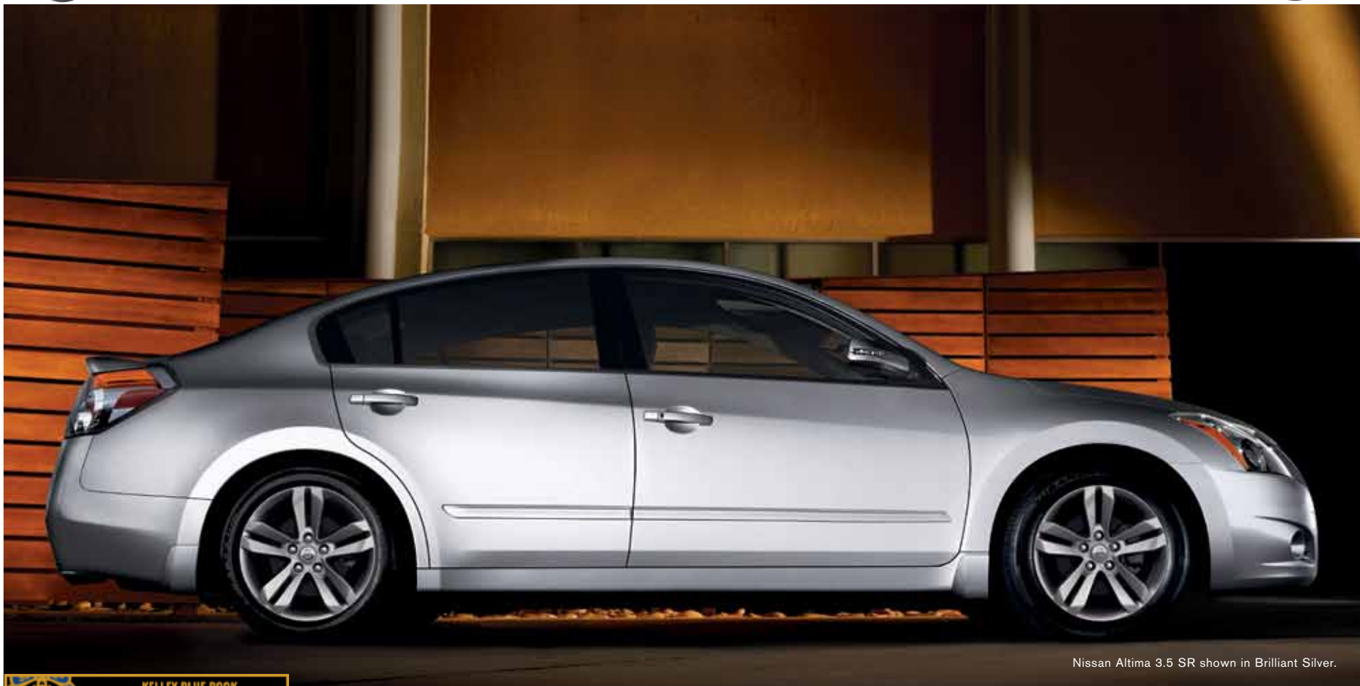
Nissan Altima 3.5 SR shown in Brilliant Silver.