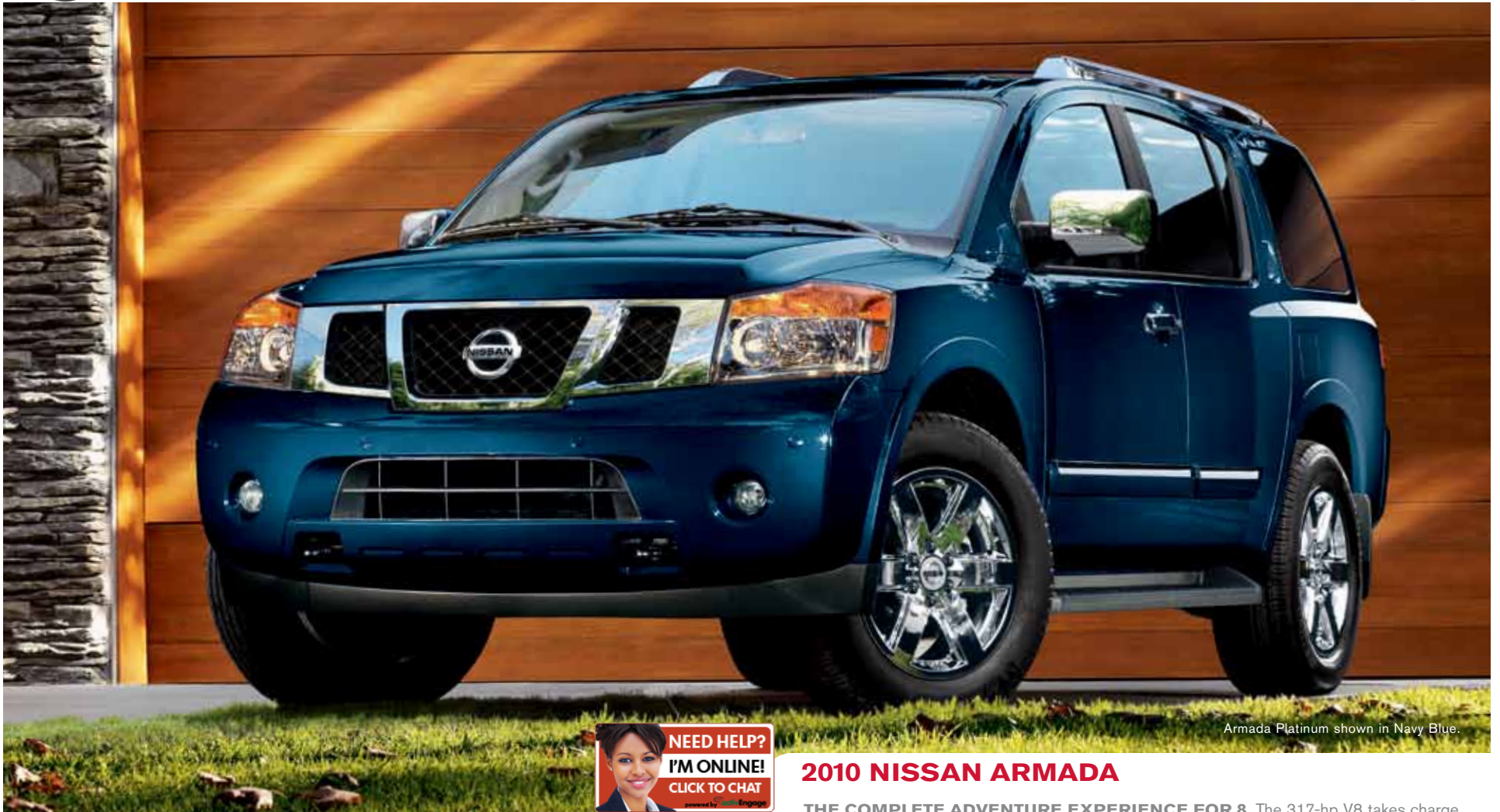
Armada Platinum shown in Navy Blue.