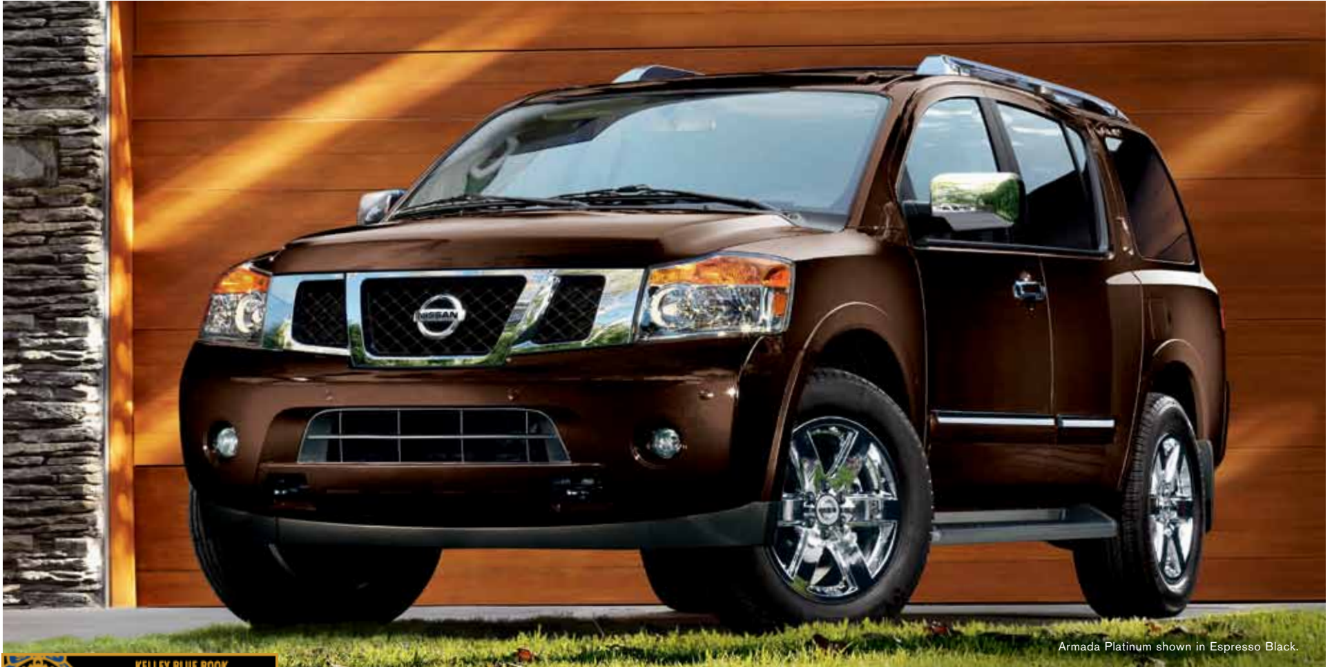
Armada Platinum shown in Espresso Black.