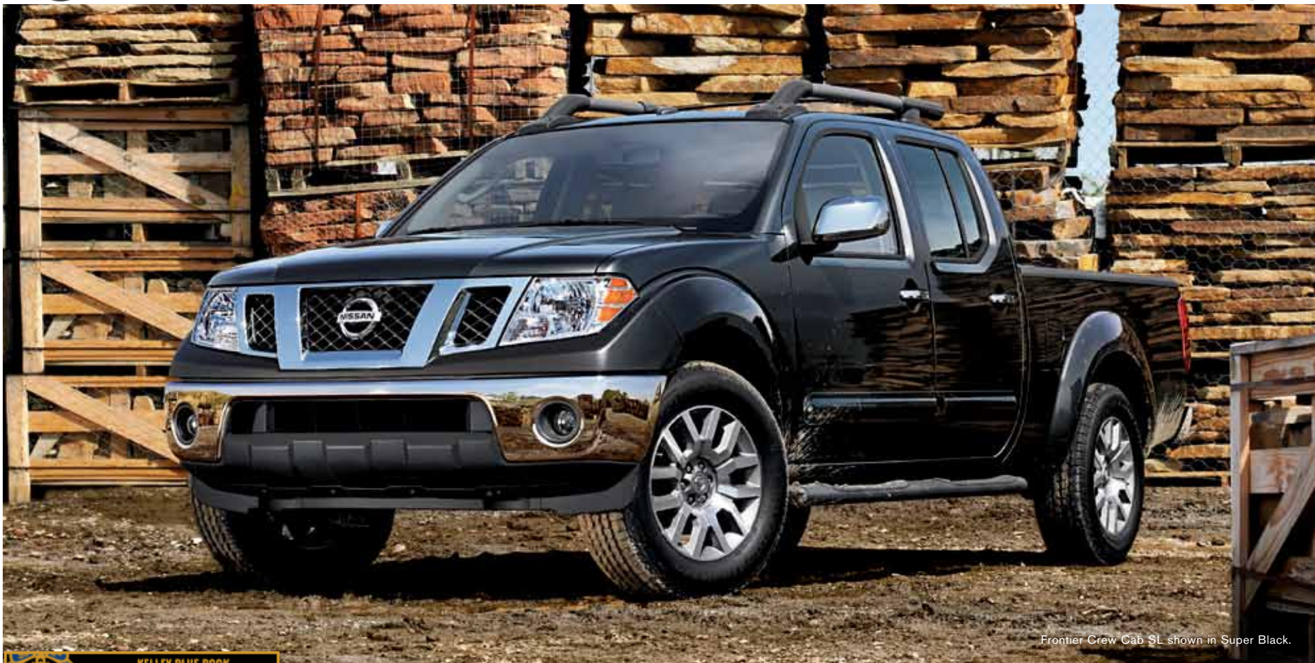
Frontier Crew Cab SL shown in Super Black.