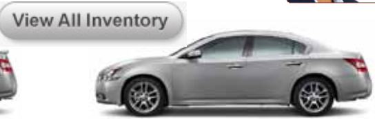
3.5 SV: WITH PREMIUM PACKAGE