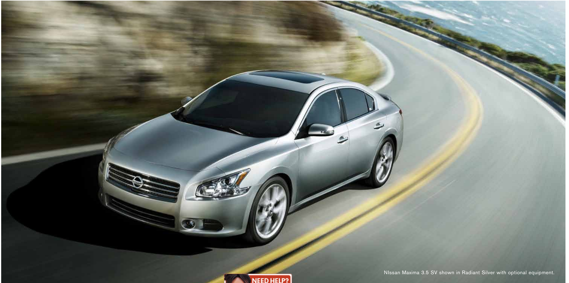
Nissan Maxima 3.5 SV shown in Radiant Silver with optional equipment.