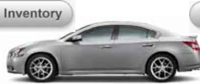
3.5 SV: WITH SPORT PACKAGE