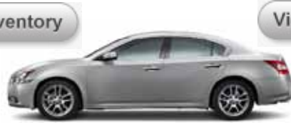
3.5 SV: REFINED PLUS EXTRAS