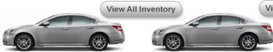
3.5 S: 4DSC™ PERFORMANCE BEGINS HERE