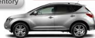
S: REDEFINITION OF ADVENTURE