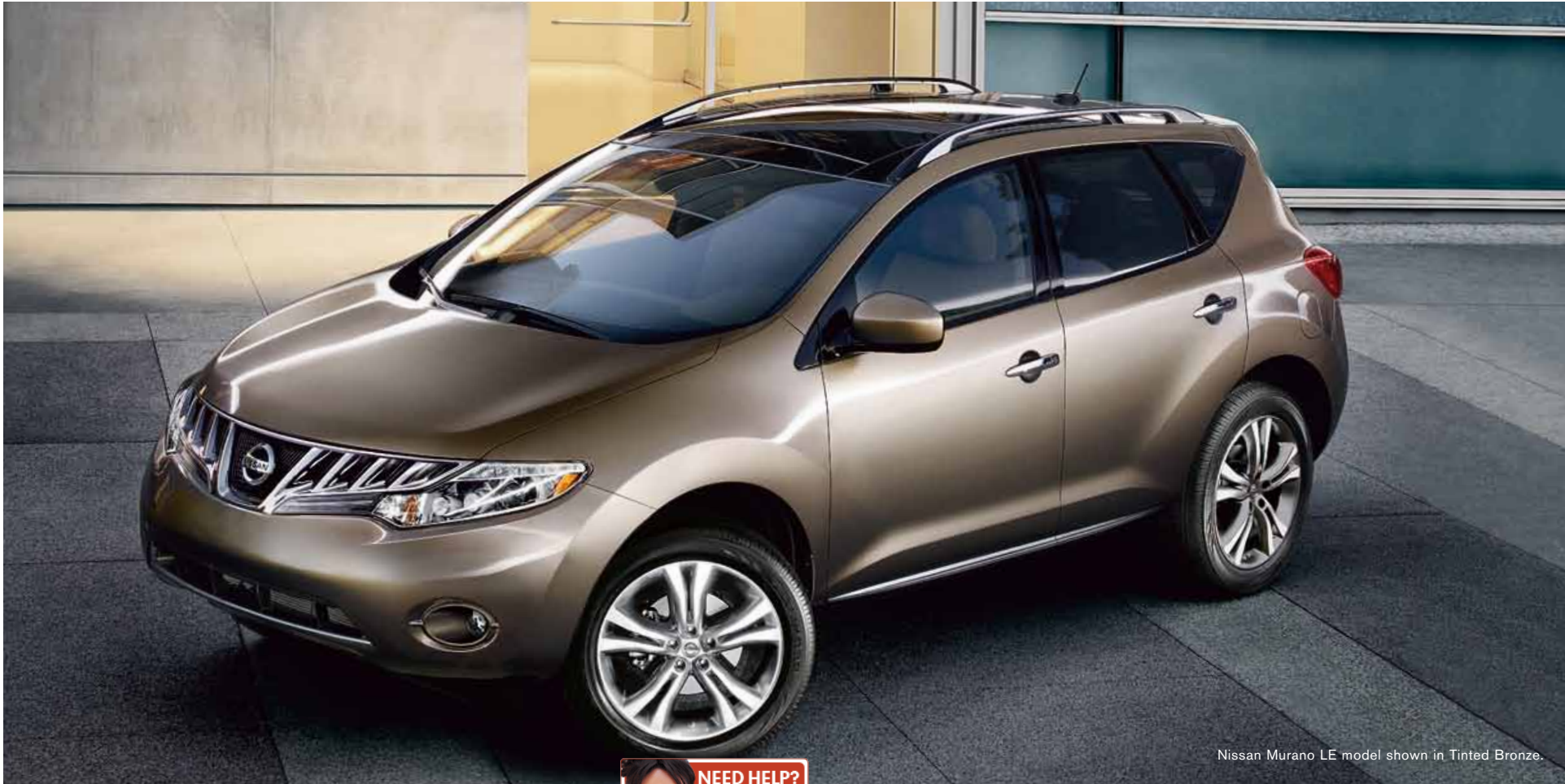
Nissan Murano LE model shown in Tinted Bronze.