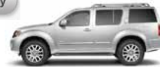
S FE+ AND S: READY FOR ADVENTURE