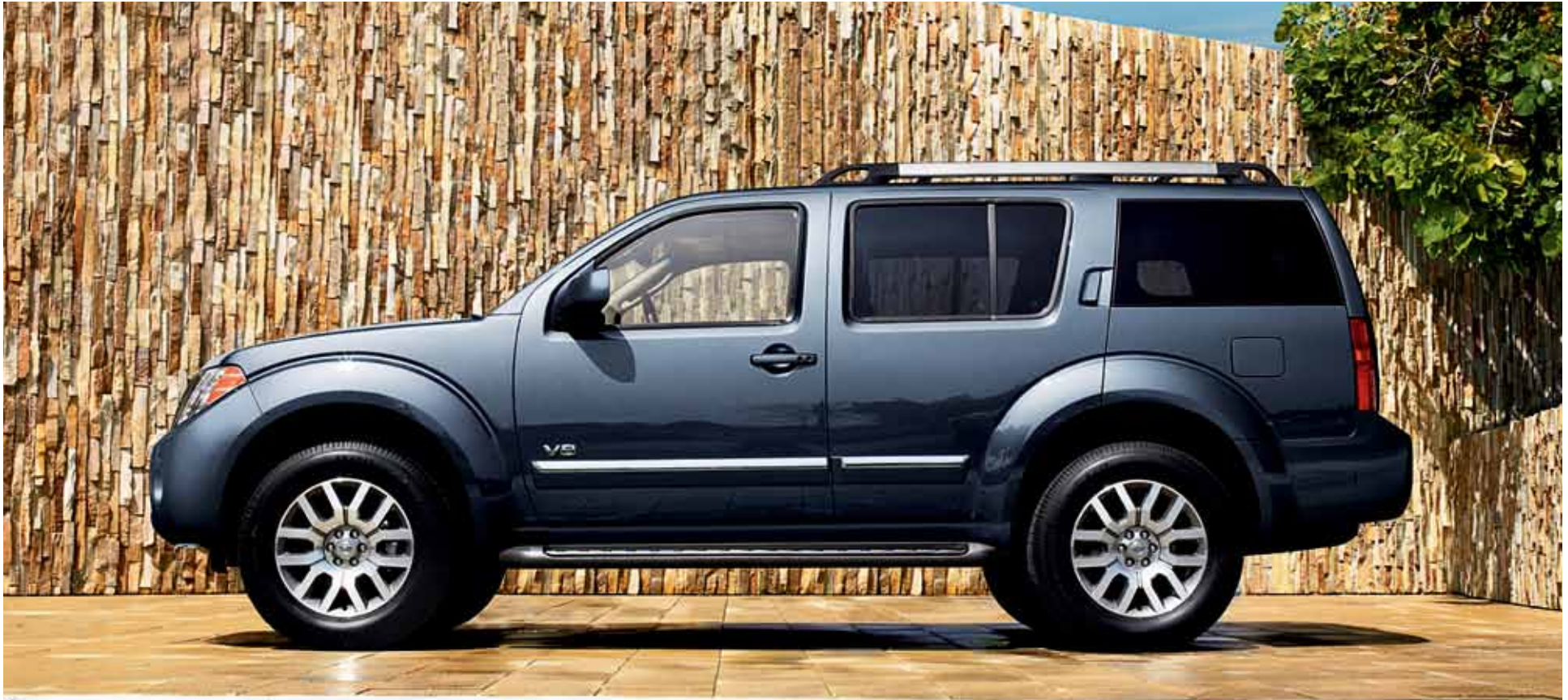
Pathfinder LE shown in Dark Slate.