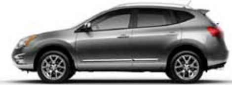
S: THE ORIGINAL CROSSOVER