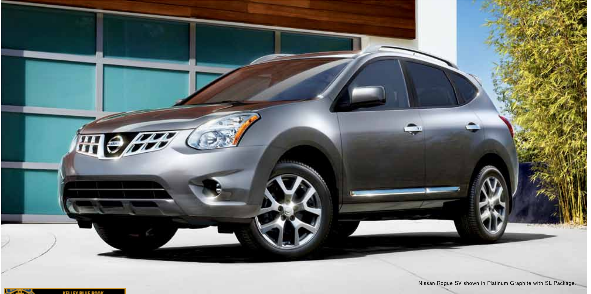
Nissan Rogue SV shown in Platinum Graphite with SL Package.