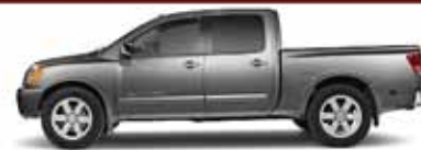
LE CREW CAB