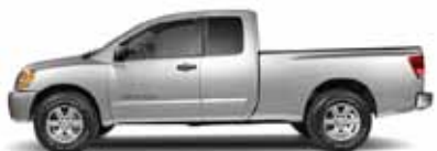
SE KING CAB AND CREW CAB