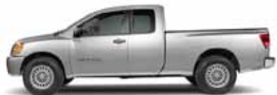
XE KING CAB AND CREW CAB