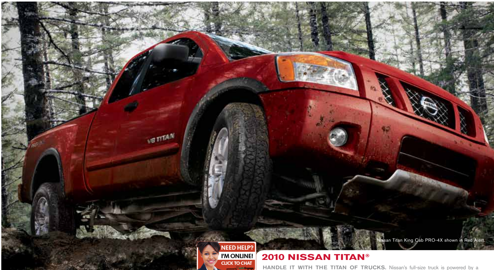
Nissan Titan King Cab PRO-4X shown in Red Alert.