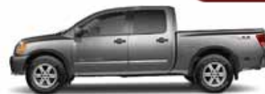
PRO-4X KING CAB AND CREW CAB