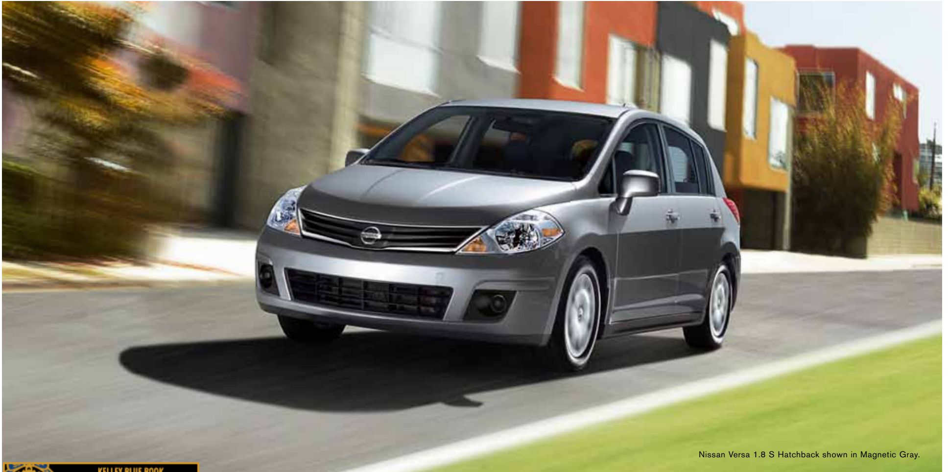
Nissan Versa 1.8 S Hatchback shown in Magnetic Gray.