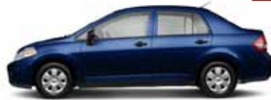
1.6: SEDAN ONLY