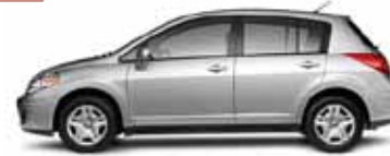
1.8 S: HATCHBACK AND SEDAN