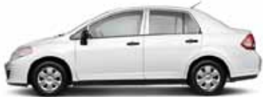
1.6 BASE: SEDAN ONLY