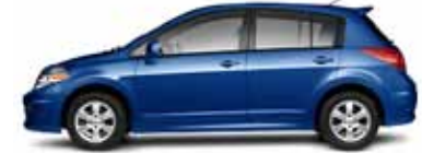
1.8 SL: HATCHBACK AND SEDAN