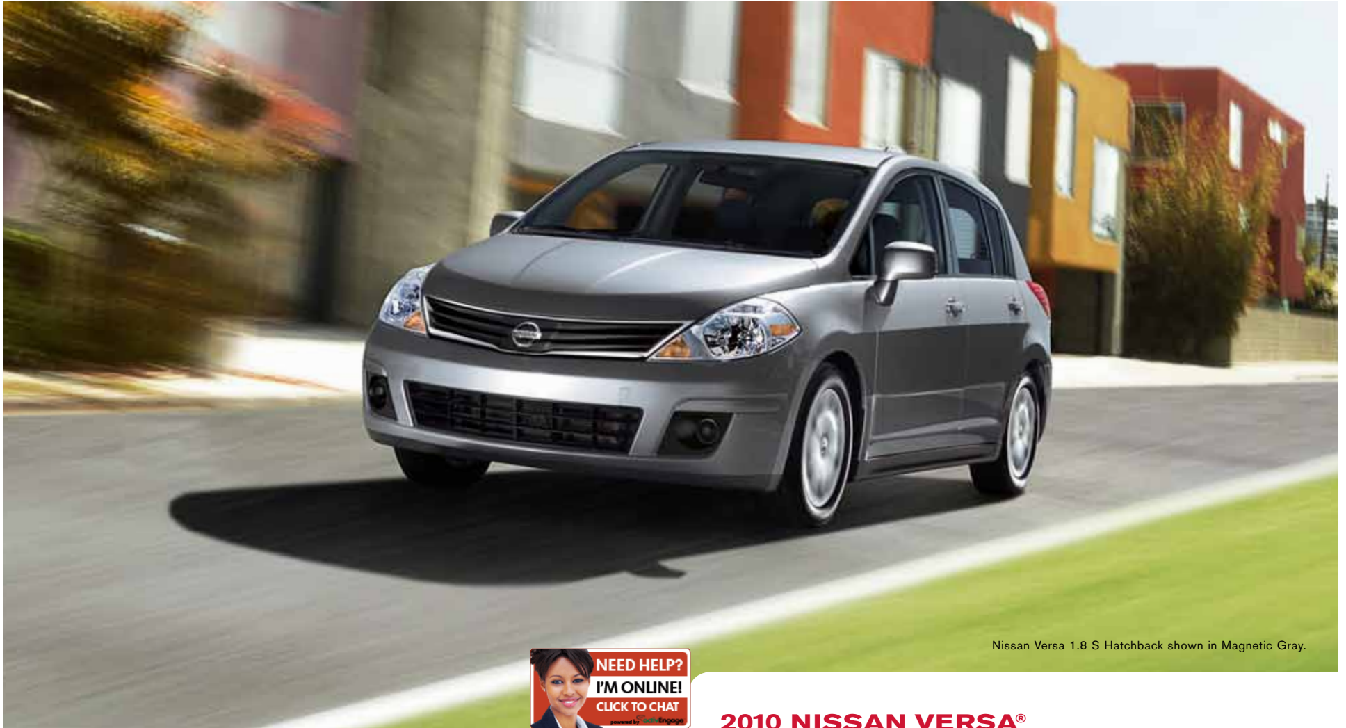
Nissan Versa 1.8 S Hatchback shown in Magnetic Gray.