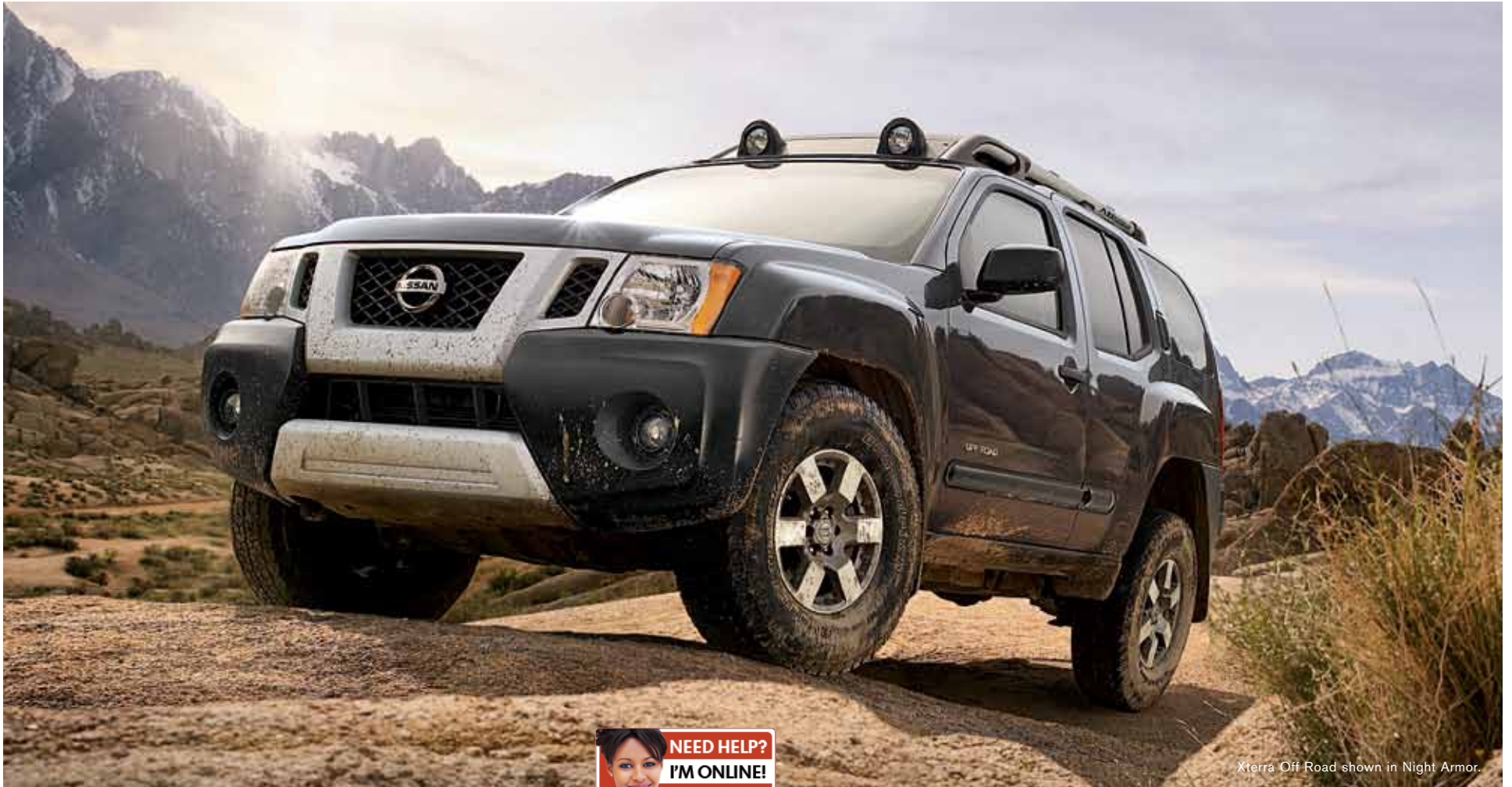
Xterra Off Road shown in Night Armor.