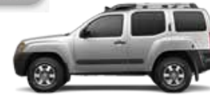
PRO-4X: WILD TO THE CORE