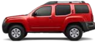
X: CORE EQUIPMENT