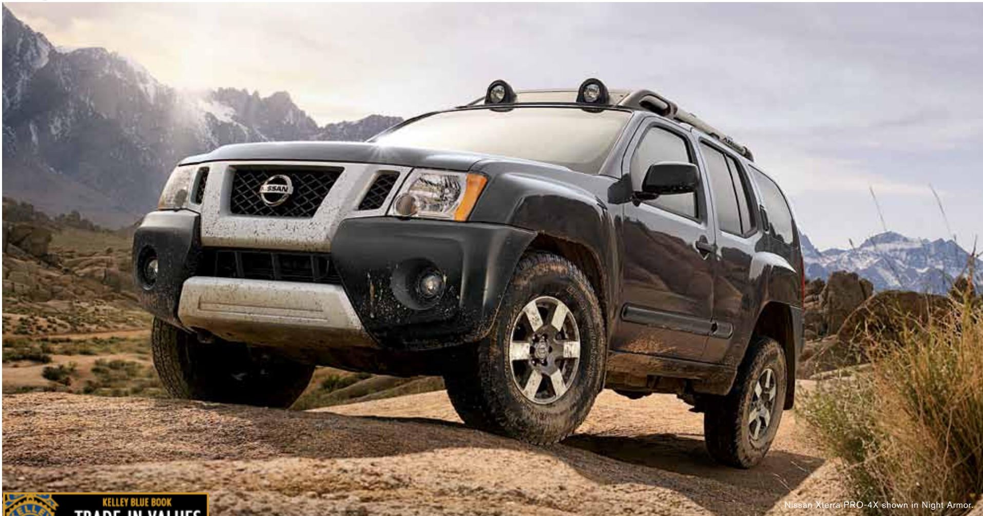
Nissan Xterra PRO-4X shown in Night Armor.